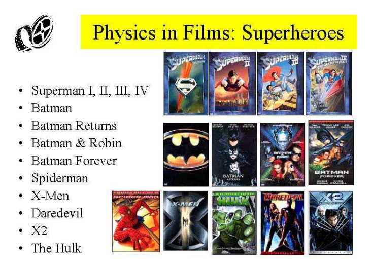
Figure 4: Physics In Films: Superheroes Films

Part of the motivation for offering the Superheroes flavor came from a course given by Jim Kakalios at the University of Minnesota-Twin Cities (Feder, 2002). He has taught a successful course in physical science based on superhero comic books. The Physics in Films: Superheroes flavor complements Kakalios' approach, substituting motion and 'real' action for static images. It was first taught in the summer 2003 term using the films shown in Figure 4.