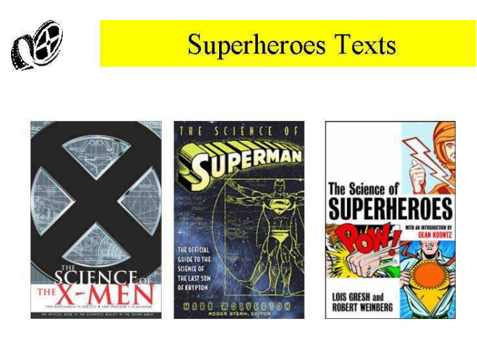
Figure 5: Physics In Films: Superheroes books.

The topical content of Physics in Films originally closely followed that of traditional physical science courses. The textbook was "Fantastic Voyages" (Dubeck et al., 1994). While somewhat 'lighter' than a typical physical science textbook, it uses some (rather old) movies as illustrations and is the only such text available. In Physics in Films: Superheroes classes however, the authors deviated somewhat from the traditional path and added some decidedly non-traditional books. They were "The Science of Superheroes" (Gresh & Weinberg, 2002), "The Science of Superman" (Woolverton, 2003), and "The Science of XMen" (Yaco & Haber, 2000), all illustrated in Figure 5. Stocked in the trade book sections of the bookstores, they are replete with applications of the concepts of physical science. The authors of these books frequently use physical laws in an effort to make the powers of the superheroes plausible to the lay reader. In so doing they provide fertile ground for lively discussions.