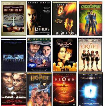
Figure 6: Films used in Physics in Films: Pseudoscience

The topics covered and related to pseudoscience included, among others: