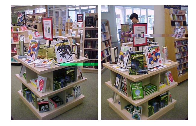
Figure 8: UCF Bookstore display for Physics in Films.

A Course Book Display. The UCF campus bookstore cooperated by installing a prominent display 'island' featuring the Physics in Film: Superheroes and Physics in Film: Pseudoscience courses (Figure 8). The display attracted student attention and (the authors suspect) increased sales of the displayed books, as well.