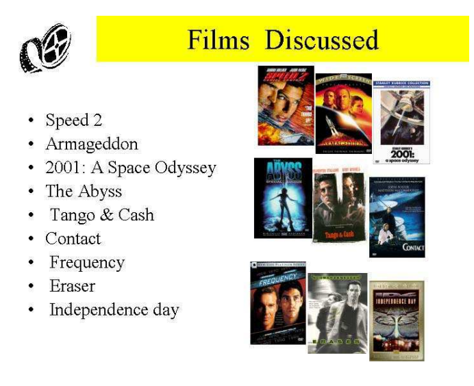
Figure 1: Summer 2002: Action/Adventure/SciFi Movies.

Figure 1 shows the nine movies used that first summer. Students were required to watch the films at home and turn in a brief, written analysis of the physics principle illustrated in each of three scenes of their own choosing (homework!). In class, five to ten percent of the class (of 90 students) were called upon each day to orally present their analysis of one scene to the class. Both the written and oral analyses became part of their grade in the course.